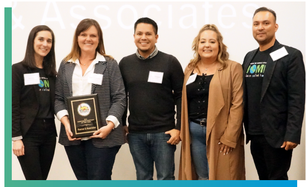
Keenan & Associates Corporate Partner of the Year