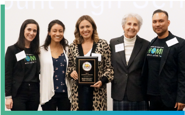
Marymount High School Legacy Award

In January 2020, we held our annual Volunteer & L.I.F.E. Mentoring Recognition Luncheon to acknowledge the hard work of the individuals and groups that volunteer with us and participate in our mentorship program. We are truly lucky to have a community of such compassionate, generous people who are dedicated to making a difference in the lives of our youth and our community.