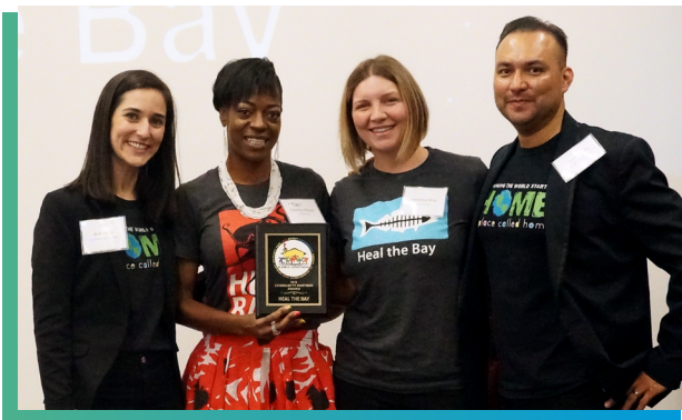
Heal The Bay Community Partner of the Year