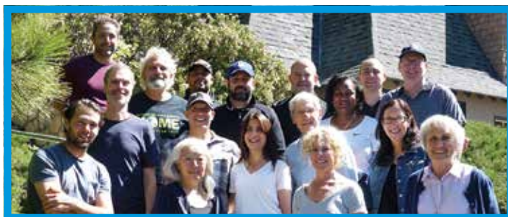
APCH Board of Directors

NEW! JOIN OUR SOCIAL CHANGE CLUB - SCC is for