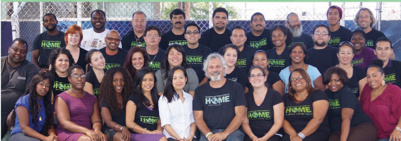
Come meet all the friendly and dedicated staff at APCH — Call today to arrange a tour: (323) 232-7653 ext 2237

Dreams are the touchstones of our character. — Henry David Thoreau